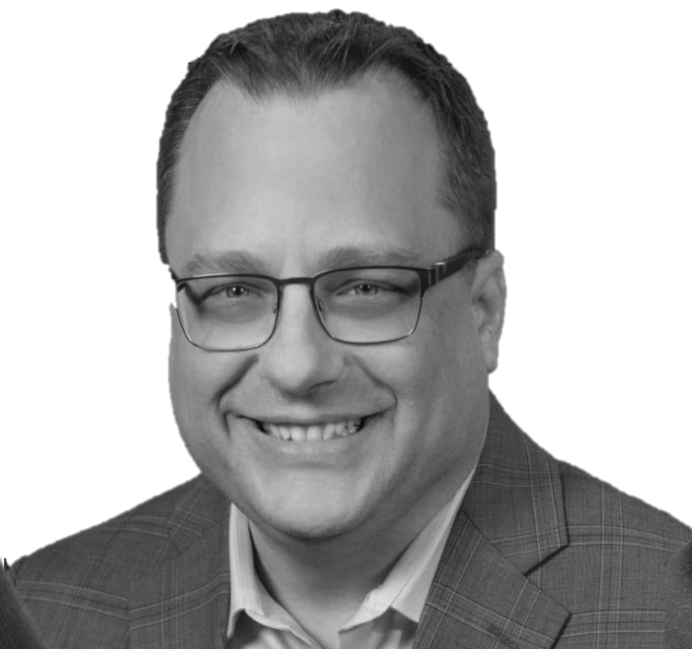
Tracy Homesteaders Life