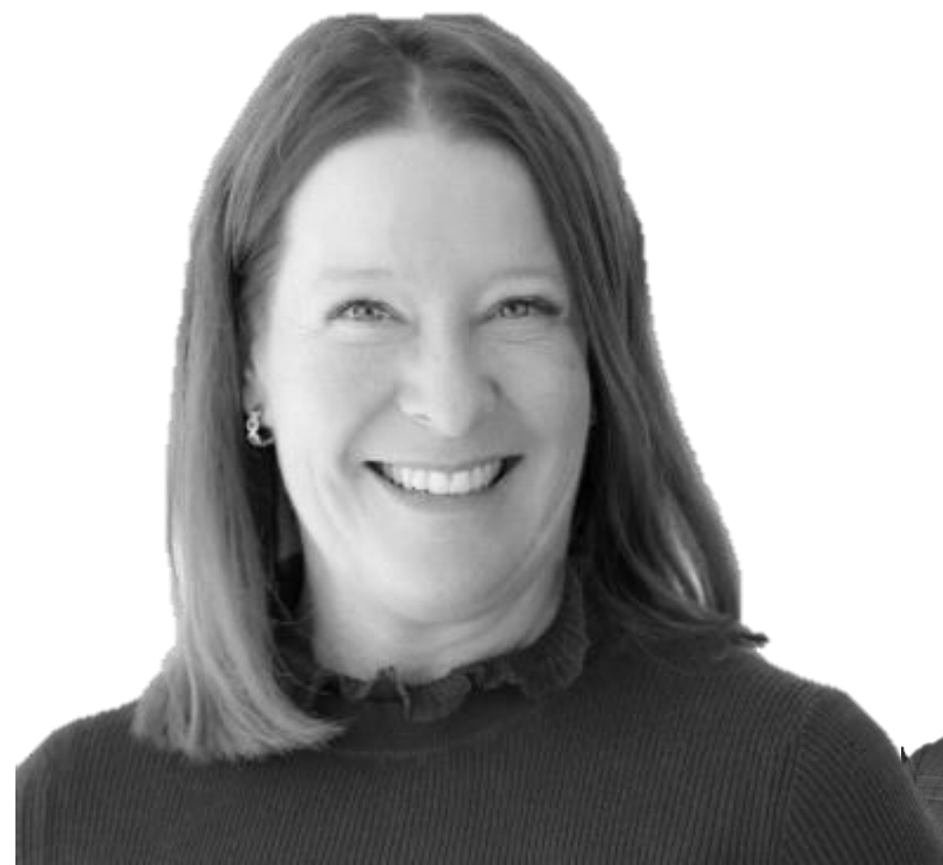
Chad Resolution Life